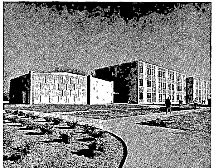
Arts and Science Building, University of Missouri