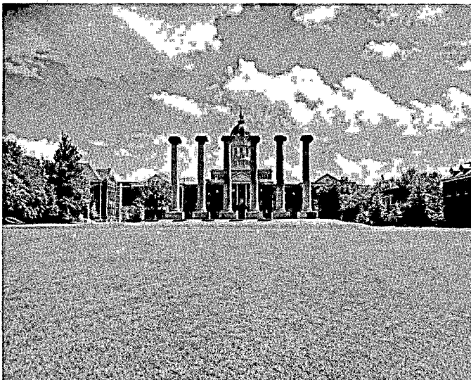
Francis Quadrangle, University of Missouri

Petitions for charters to found chapters of Eta Sigma Phi have been received from the following institutions, listed in the order in which they were received. Local chapters should inform their delegates to the National Convention of their approval or disap-