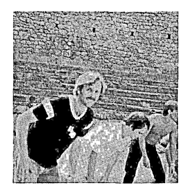
Greek games still hold a fascination at Delphi.