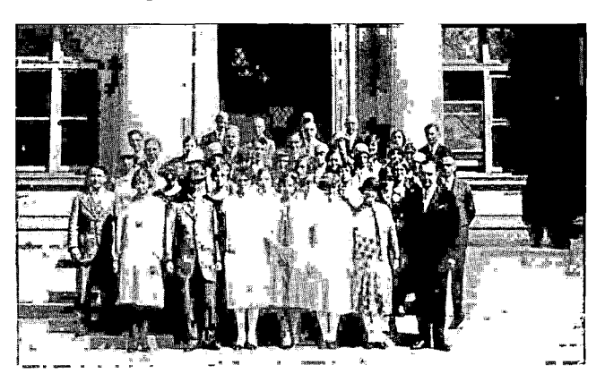
DELEGATES TO SECOND NATIONAL CONVENTION

When the conventions have met in large cities our hosts have regularly provided us with means of becoming