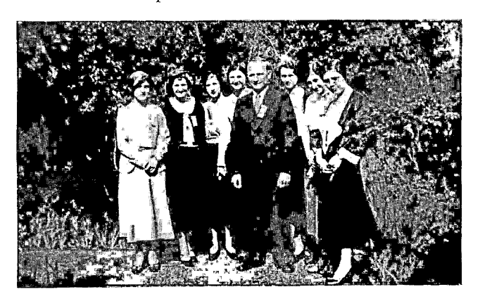
GAMMA IN THE GARDEN OF THE HERMITAGE

The last report was that of the Nominations