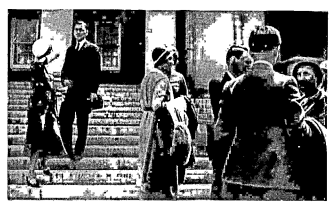
Delegates Off Duty

The business session Saturday morning began at 8:30