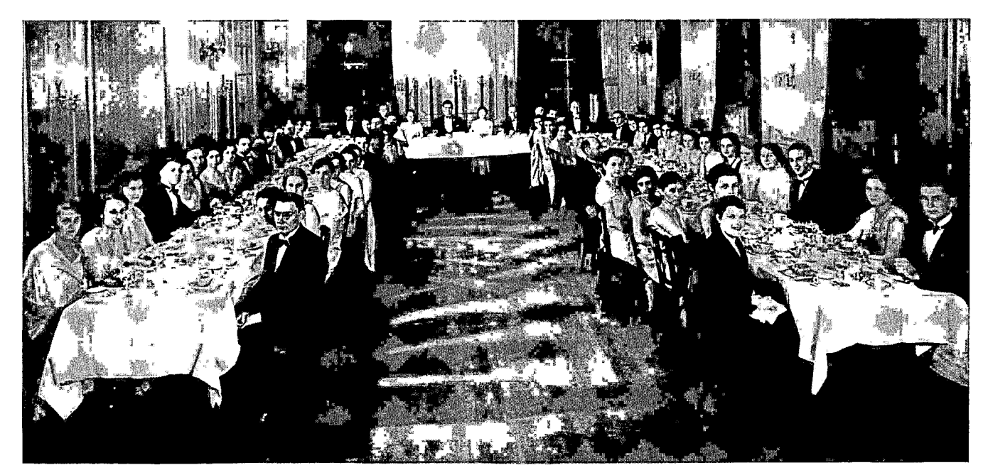
BANQUET SCENE AT THE ANDREW JACKSON HOTEL

Committee. The following people were nominated and elected as officers for 1932-1933: