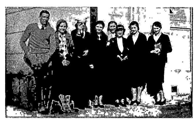
ZETA AND GAMMA ENROUTE TO NASHVILLE

Another business session followed the lecture, in which the reports of the Megas Chrysophylax, the Megas