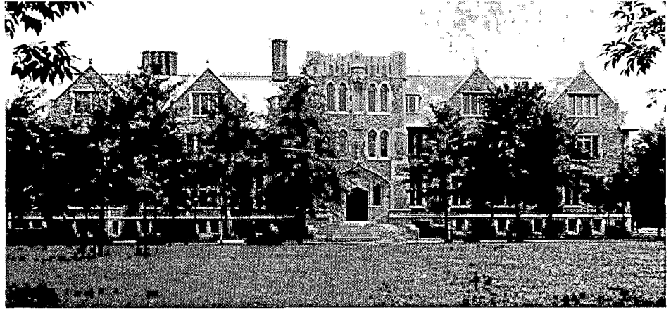
WOMEN'S BUILDING, WHERE CONVENTION SESSIONS WILL TAKE PLACE

The Old Courthouse stands at the corner of Broadway and Market Streets, a century-old historic spot on the steps of which slaves were auctioned in ante-bellum days, along with other personal property. The stone auction block may still be seen, as well as the prison cells in the basement and the courtroom in which Dred Scott's famous case for freedom was begun. At that time