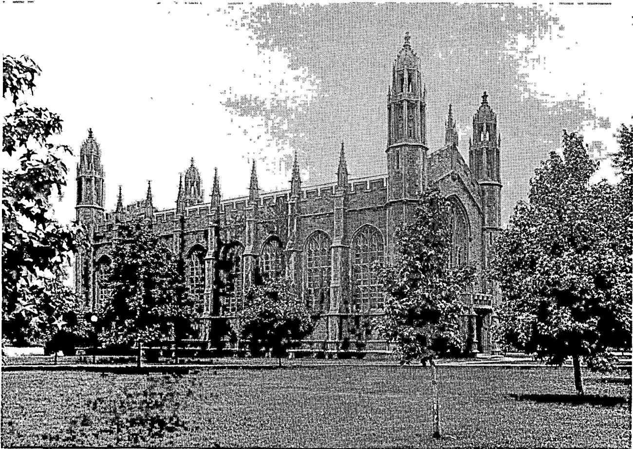
GRAHAM MEMORIAL CHAPEL