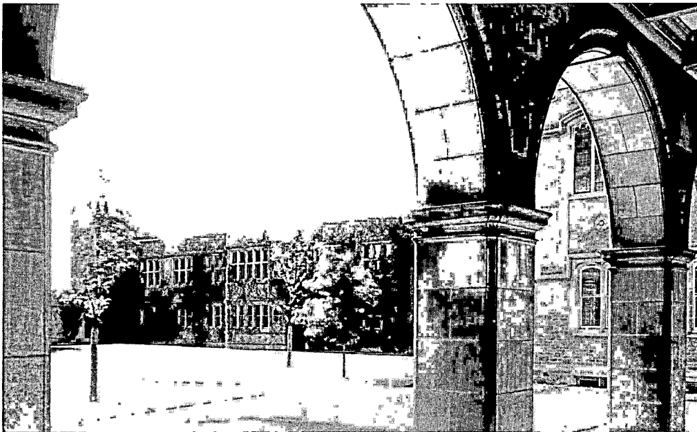
THE QUADRANGLE, WASHINGTON UNIVERSITY

After viewing these interesting historic spots, one may wish to turn his attention to more modern things. In that event, located near the city and easily accessible to visitors, is the huge million-dollar municipal airport. It is one of the best and most completely equipped