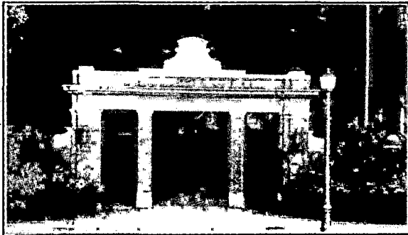
Memorial Gateway, Ohio University