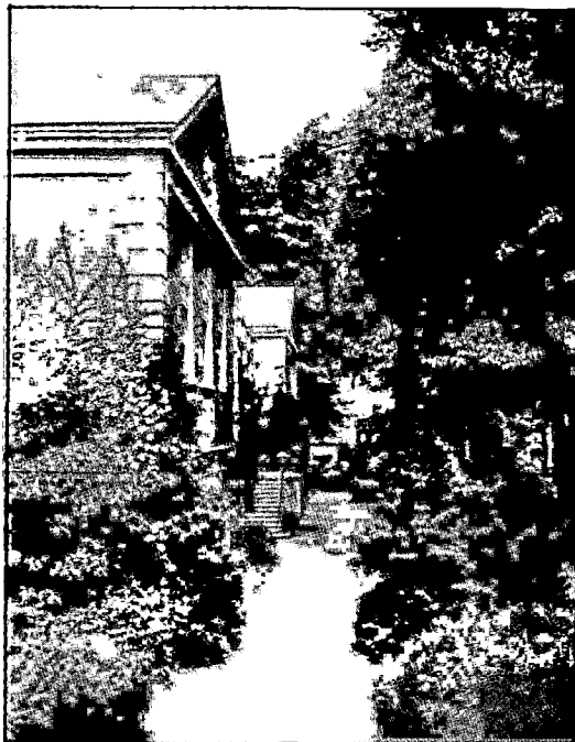
Chubb Library, Ohio University