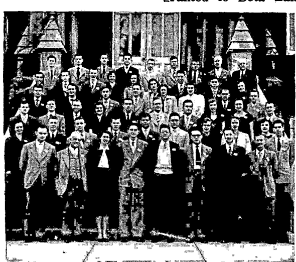
Twenty-second National Convention Group

In view of present needs the Convention granted the Grand Executive Council permission to act on other netitions from schools with which there had been correspondence but no final action at the time of the Twenty-second National Convention. Several institutions fall into this group.