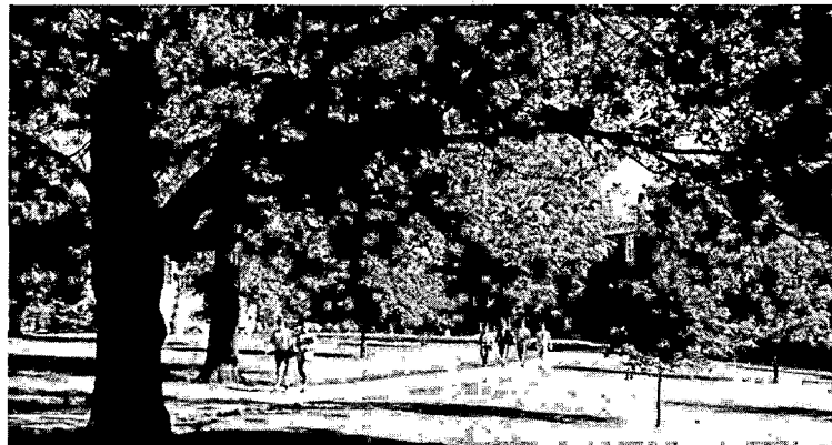
Campus Scene, University of Kentucky