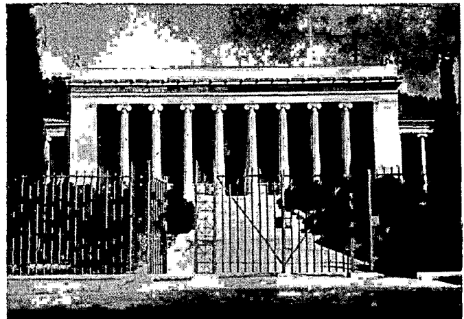
Gennadius Library, Athens, Greece