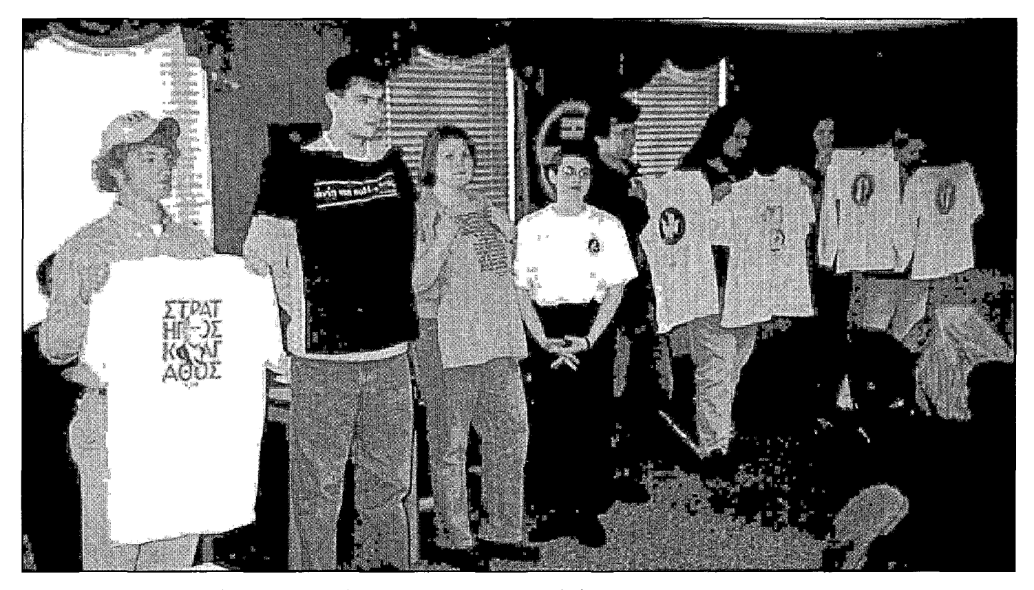
At the convention delegates show their chapters' T-shirt entries as the vote for the best begins.