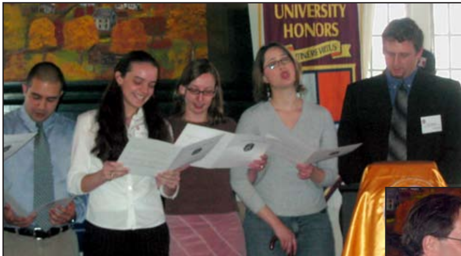
Left and below, singing the "Song for Eta Sigma Phi" to close the convention.