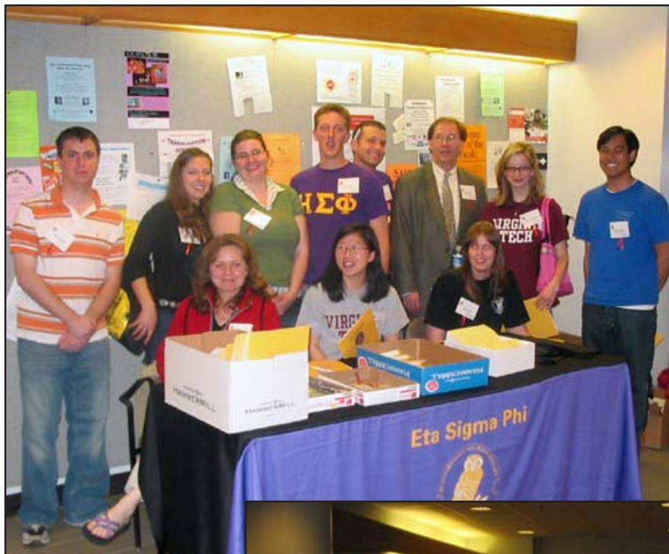
Above, members of Eta Eta at Virginia Tech preparing to welcome delegates to the convention.