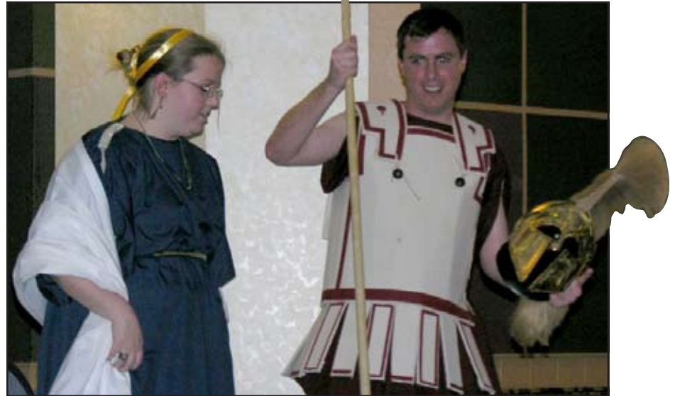
Best Dressed Femina and Best Dressed Vir