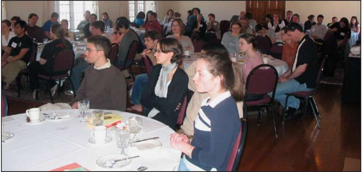
Delegates at the Sunday morning business meeting.