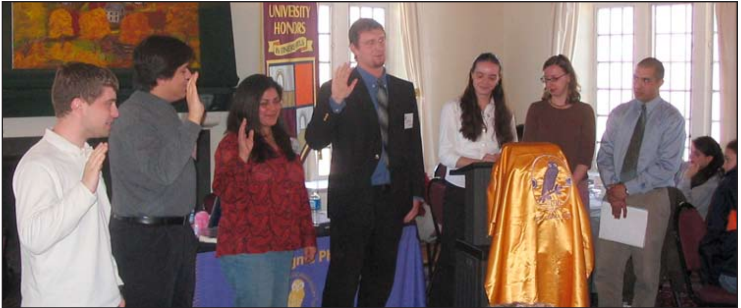
Above, swearing in the New Officers.