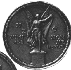
Obverse and reverse of the large silver medal

ment. In addition, chapters can award the medals to outstanding students of the Classics at their home institutions. Two silver medals are available: the large medal (1½ inches) at $28.75 and the small (¾ inch) at $10.25. A bronze medal (¾ inch) is available at $6.50. The various medals can be awarded to students at various levels of their study.