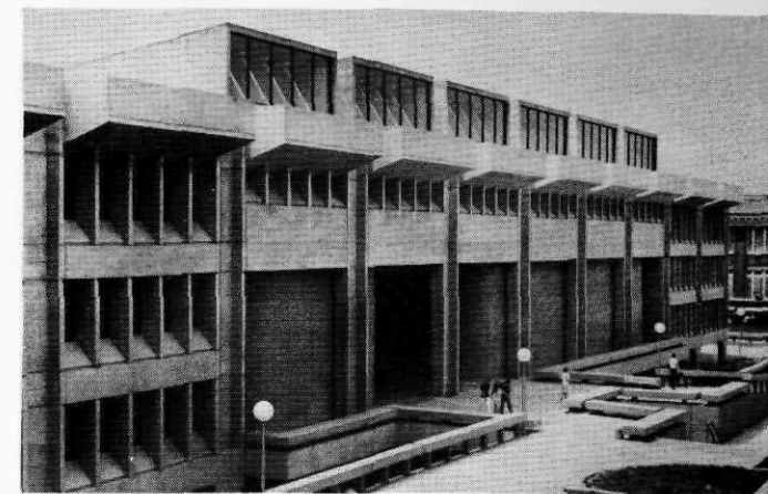
The new academic complex at Millsaps houses two recital halls, a reception room, an art gallery, two listening labs and part of the Millsaps Library.